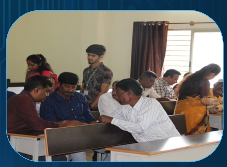
6th Sem on 8/12/2024