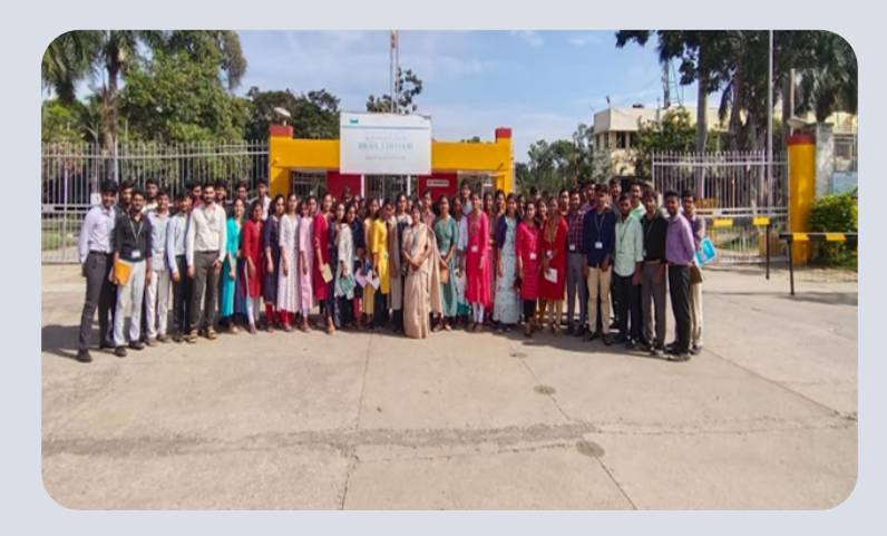
Industry visit to BEML Mysore